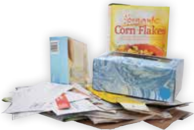
Mixed Paper, Paper Board, Newspaper and Magazines Flatten cardboard and boxes.