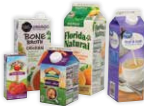
Food and Beverage Cartons Empty, rinse and replace cap.