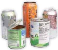
Aluminum and Steel Cans Empty and rinse.