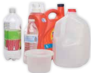
Kitchen, Laundry, Bath Bottles and Containers Empty, rinse and replace cap.