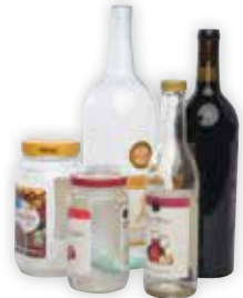
Bottles and Jars Empty, rinse and replace cap.